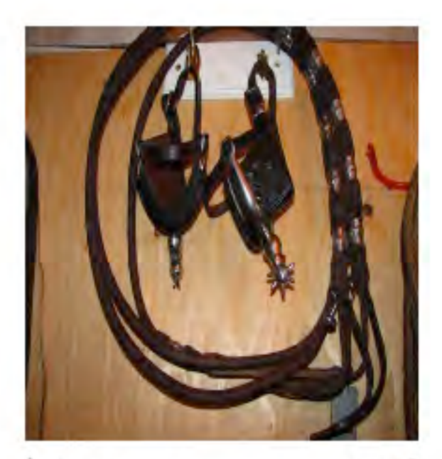
Ladies Show Peruvian Spurs.. $175.00 Seruvian reins..brown..med weight..$170.00