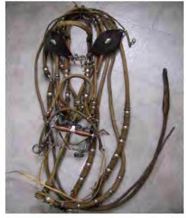
Natural colored headset..complete in very nice shape Heavier braid..with 5" copper bit.. $550.00